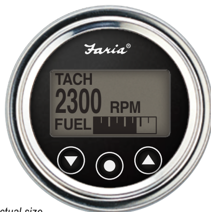
Shown actual size

A complete engine monitoring solution for the small engine CAN bus market.